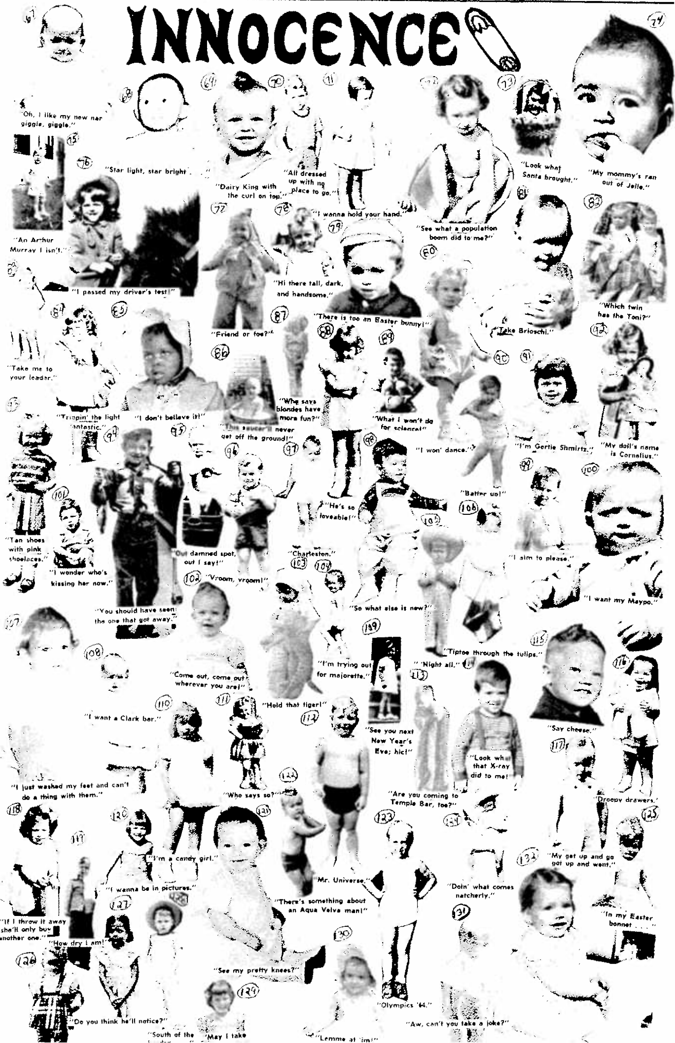
64 "Oh, I like my new nar giggle, giggle."