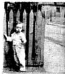
THEN . . .

Day: Thursday, Valentine's Day Place: Bradcock General Hospital